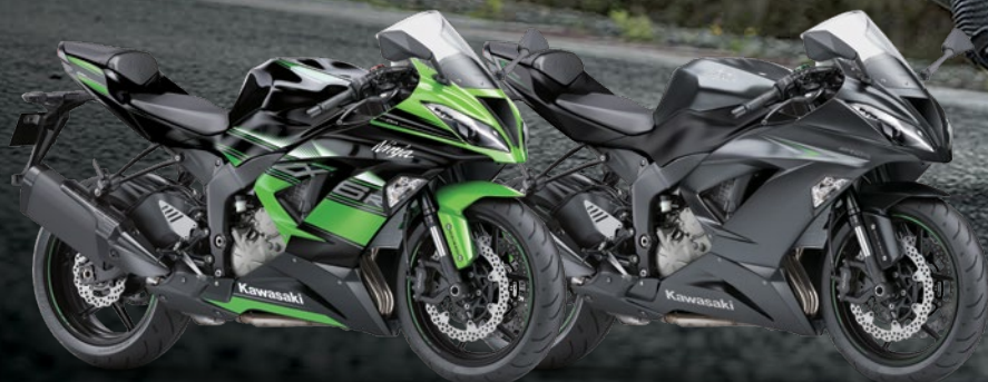
Ninja ZX-6R (636) ABS KRT Edition