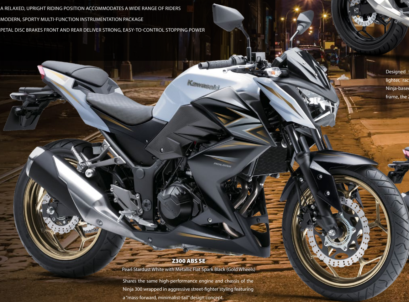
Z300 ABS SE

Designed for the sports-minded urban commuter, this lighter, racier alternative to the Z300 offers competitive Ninja-based performance. Featuring an original trellis frame, the Z250 is slim, nimble handling and super light.