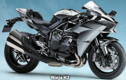
Ninja H2 Mirror Coated Spark Black

The launching point for the development of the Ninja H2 was a strong desire to offer riders something they had never experienced before. The design team committed to developing the “ultimate” motorcycle with a truly extraordinary riding experience, from a clean slate. The bike needed to deliver intense acceleration and an ultra-high top speed, coupled with supersport-level circuit performance. To realise this goal, help was enlisted from other companies in the Kawasaki Heavy Industries (KHI) Group. An unprecedented level of intercompany collaboration yielded incredible results in a motorcycle that offers a sensory experience surpassing anything else riders can find today.