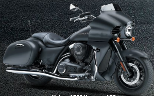
Vulcan 1700 Vaquero ABS Metallic Flat Spark Black