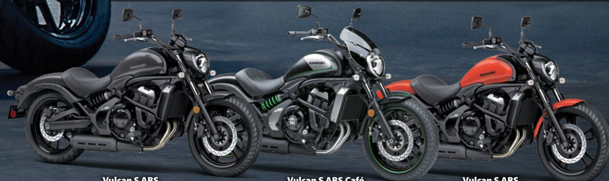
Vulcan S ABS

Action image shows overseas model with optional accessories