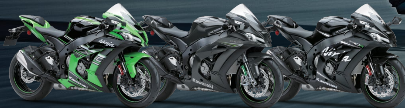
Ninja ZX-10R ABS KRT Replica

Lime Green and Ebony (ABS and Non-ABS available)