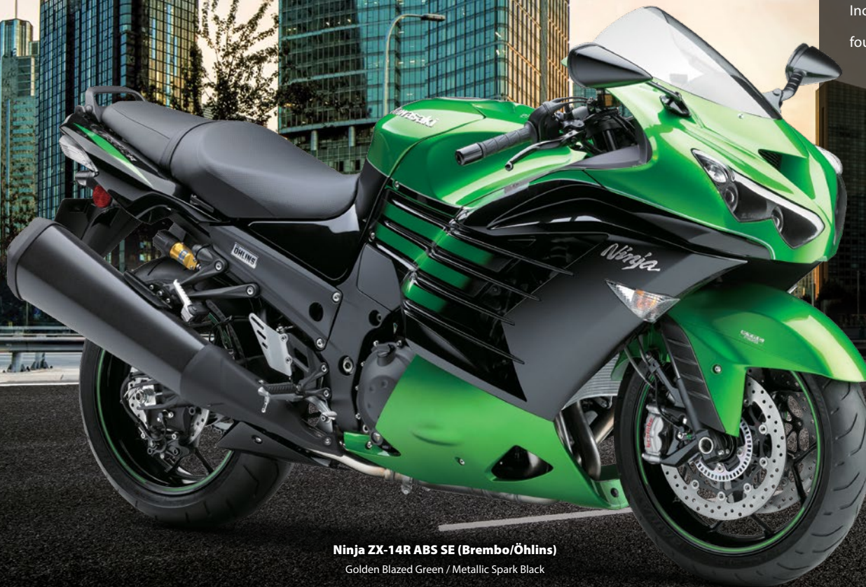
Ninja ZX-14R ABS SE (Brembo/Öhlins) Golden Blazed Green / Metallic Spark Black