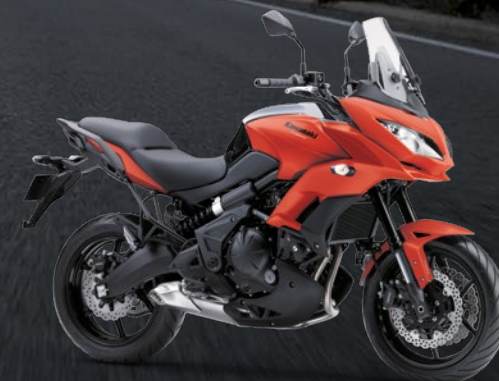
Versys 650 ABS

Candy Matte Orange / Metallic Spark Black