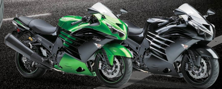
Ninja ZX-14R ABS SE (Brembo/Öhlins) Golden Blazed Green / Metallic Spark Black