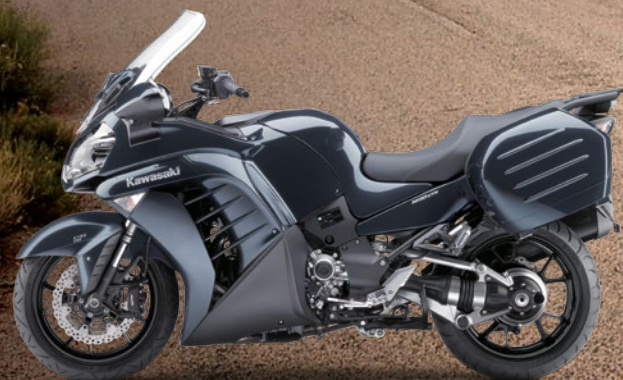
1400GTR ABS Metallic Slate Blue