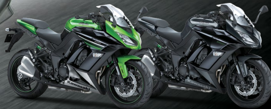
Ninja 1000 ABS

Candy Lime Green Type 3 Metallic Spark Black